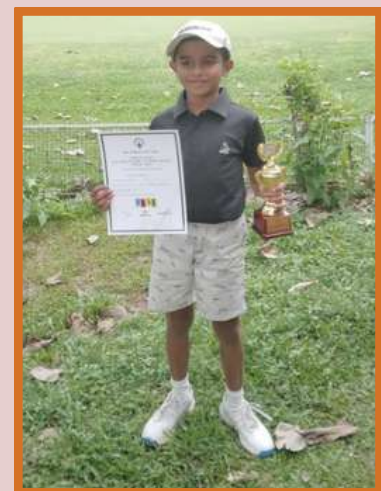
INDIAN GOLF UNION-NORTH ZONE SUB JUNIOR TOUR-2023 (JUNE 2023) DEHRADUN