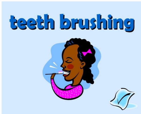
Activity with WATER

Paste the pictures of these activities on the flash cards. Speak few sentences on each flashcard when you get them to school.