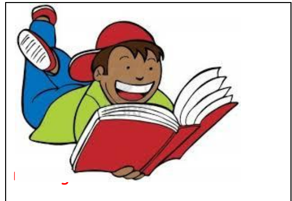
Activity without WATER