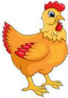
h e n