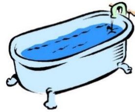
t u b